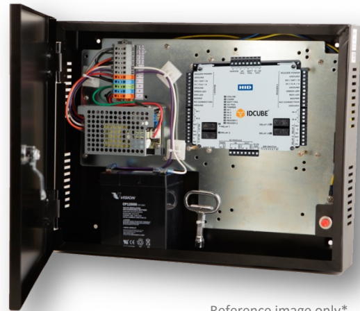
Reference image only*

IDCUBE's ICAERO-X200 is an Input Monitor Interface Panel which connects up to 19 general purpose input circuits (supervised or unsupervised) and two general purpose outputs. All supervised inputs support analog-to-digital conversion. The input interface panel comprises of HID's input interface module AERO X200 along with optional accessories, i.e., UL certified power supply, charging circuit, battery, and tamper switch. The ICAERO-X200 connects to the ICAERO-X1100 (master controller panel) through a high-speed RS-485 network.