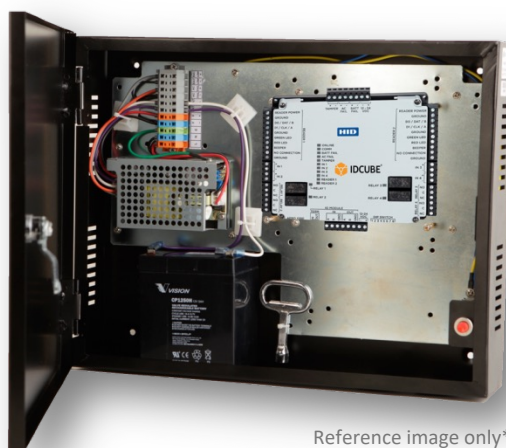
Reference image only*

IDCUBE's ICAERO-X300 is an Output Control Interface Panel which supports 12 general purpose outputs as Form C relay contacts and 5 general purpose input circuits (supervised or unsupervised). The output interface panel comprises of HID's output interface module AERO X300 along with optional accessories, i.e., UL certified power supply, charging circuit, battery, and tamper switch. The ICAERO-X300 connects to the ICAERO-X1100 (master controller panel) through a high-speed RS-485 network.