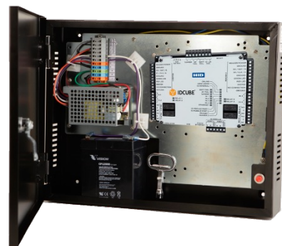
Reference image only*

IDCUBE's ICAERO-X1100 Access control panel is the next generation advanced open architecture access control platform that runs on embedded Linux, seamlessly integrates with "Access360" & "INEST" applications. The panel comprises of a new authentic intelligent controller Aero X1100 along with optional accessories, i.e., UL certified power supply, charging circuit, battery and tamper switch.